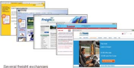
Several freight exchanges UK & mainland Europe Different charging structures – Subscription based & load fees Open/Closed schemes

Work has begun on researching the merits of individual freight exchange service providers. The research will improve understanding of the benefits to hauliers by using